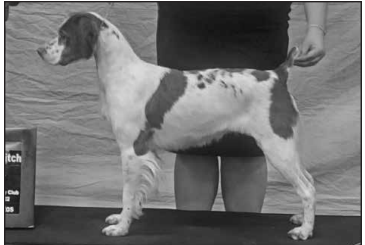
Winners Bitch TEQUILA'S DIAMOND EYES OF WIND MTN