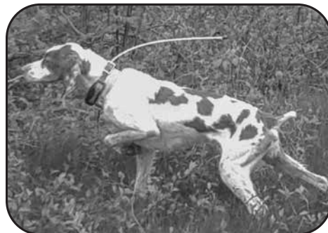
WINNIE THE WIP