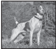
NAFB/FC/AFB Piney Run Hilltop Blew