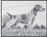
NAGDC/FC/AFB B&T's Sonndance Kid Rock