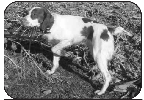
JJ'S LEVI THE LIONHEART