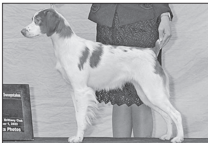
Best in Sweepstakes / Best Bred by Exhibitor BLACK RIVER'S I CAN HAVE IT ALL