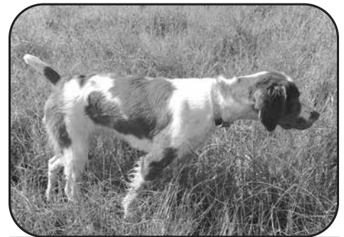
JAGOUB'S SPELL CASTER