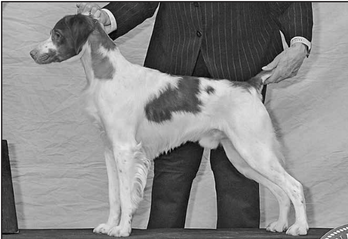
Winners Dog / Best of Winners CHERRY CREEKS KICKIN THE DUST UP JH