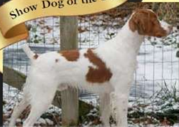
HILL'S JUST IN CASE DAWN HILL