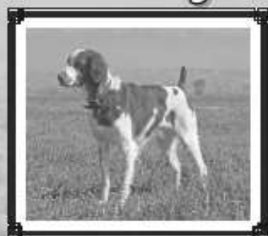
FC Quail Rock Too Tough Ellen Weinfurter