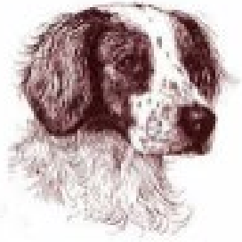
California Brittany Club